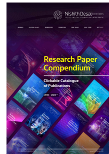
January 2025 Research Paper Compendium Clickable Catalogue of Publications