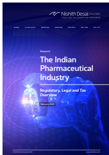
February 2025 The Indian Pharmaceutical Industry Regulatory, Legal and Tax Overview