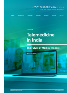
February 2025 Telemedicine in India The Future of Medical Practice