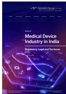
February 2025 Medical Device Industry in India Regulatory, Legal and Tax Issues